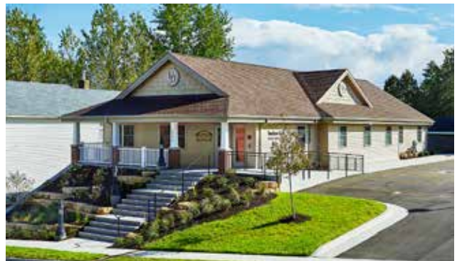
Smeltzer-Kelly Student Health Center is a state-of-the-art facility that has a comprehensive treatment team that includes medical and brain health professionals. When students return for fall 2021, they will have access to COVID-19 testing and vaccine options.

Face coverings are highly recommended. They are required in the Smeltzer-Kelly Student Health Center and may be required at clinical sites and internship locations, on public transportation, etc.